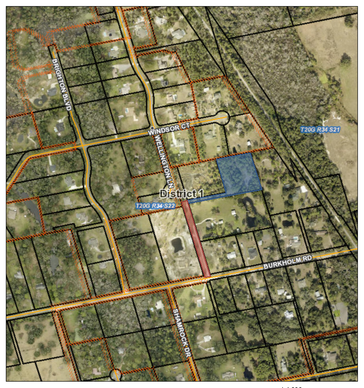
Street Label (S4800_S2400)