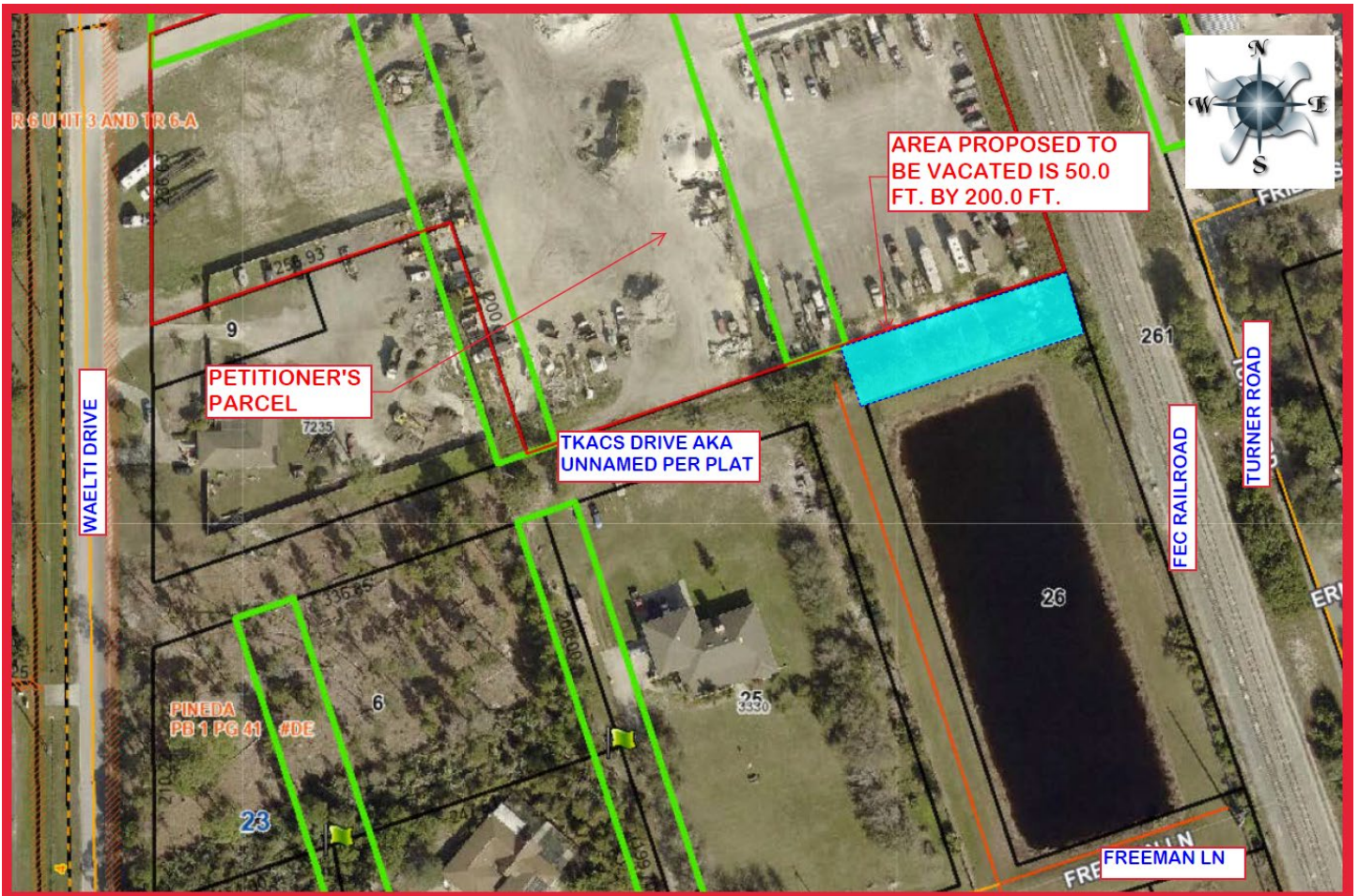
Fig. 4: Map of aerial view of Blocks 38 & 39, Town of Pineda, 7285 Waelti Drive, Melbourne, FL 32940.

KMM-FL, LLC – 7285 Waelti Dr – Melbourne, FL, 32940 – Blocks 38 & 39, plat of “Plan of Town of Pineda” – Plat Book 1, Page 41 – Section 12, Township 26 South, Range 36 East – District 4 – Proposed Vacating of a portion of a 50.0 ft. Wide Public Right-of-way