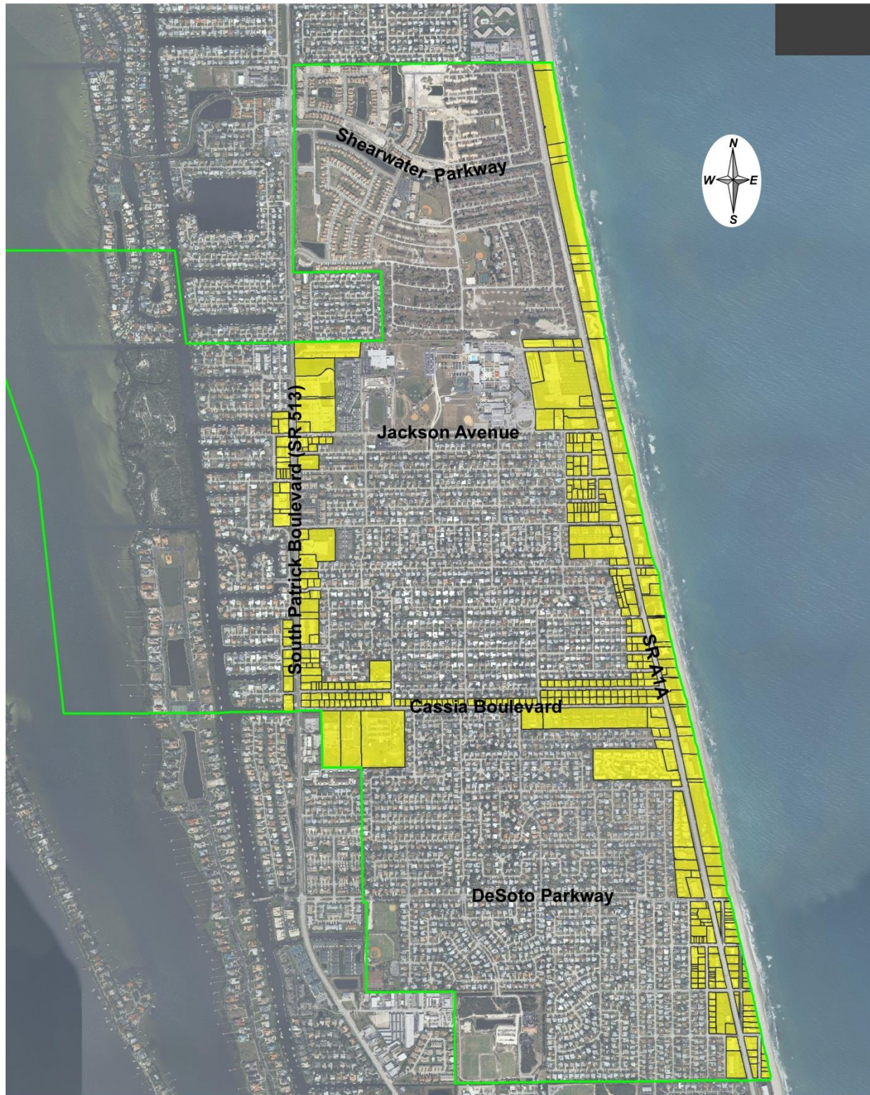
Satellite Beach Community Redevelopment District