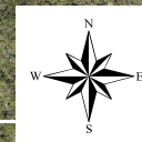
EXHIBIT A - North Courtenay Force Main - Phase 2 Capital Recovery Area