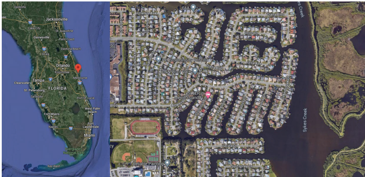
Figure 2. Diana Shores residential canal subdivision in Merritt Island, Florida.