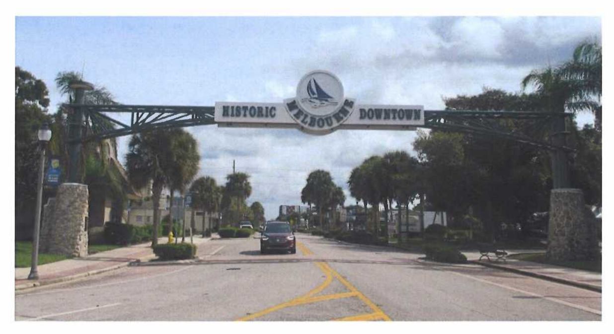
FIGURE 2 - ARCHWAY-GATEWAY REFURBISHMENT