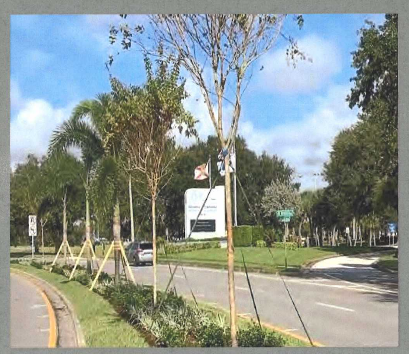
PICTURED ABOVE IS ONE OF THE MEDIANS ENHANCED BY THE NASA BOULEVARD LANDSCAPE MEDIANS PROJECT