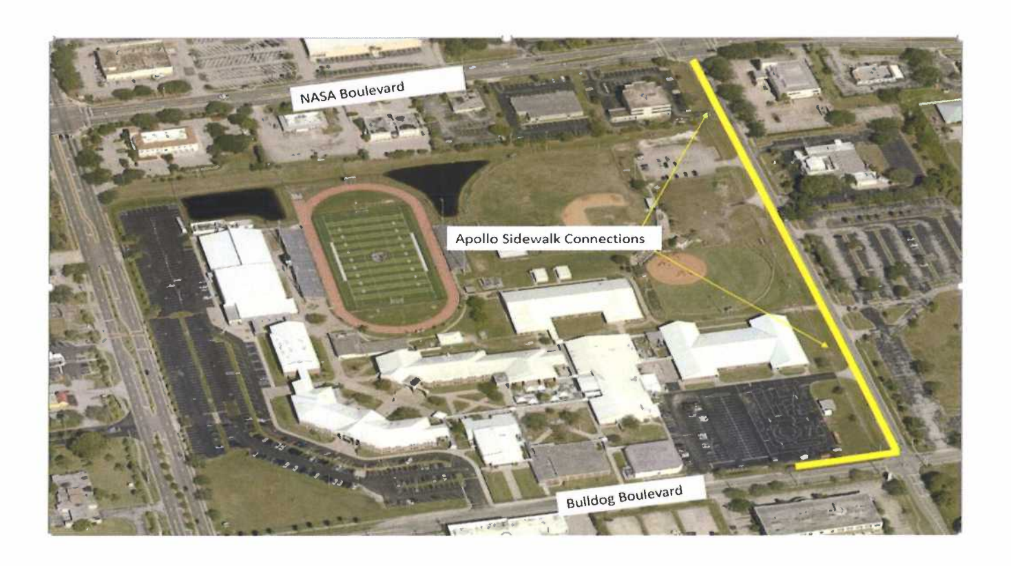
FIGURE 2 - APOLLO SIDEWALK CONNECTIONS