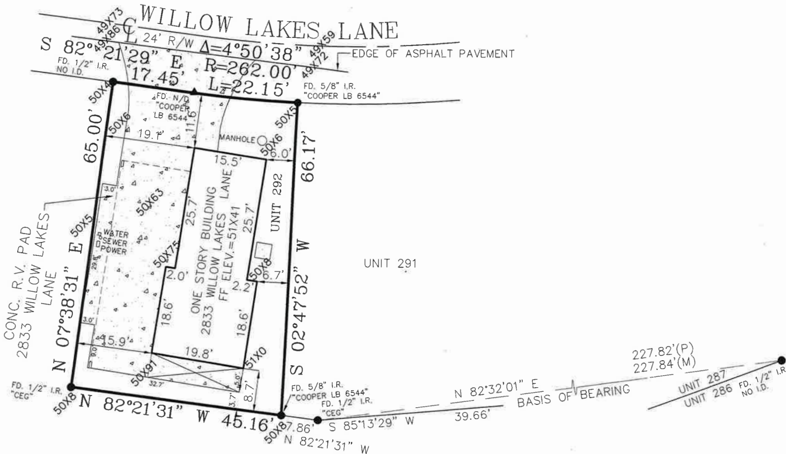
WILLOW LAKES PHASE TWO-B

THE PURPOSE OF THIS SURVEY IS TO ESTABLISH THE BOUNDARY IN ACCORDANCE WITH THE FURNISHED LEGAL DESCRIPTION AND SHOW THE ABOVE GROUND IMPROVEMENTS TO ENABLE THE OWNERS OF THIS PROPERTY TO OBTAIN PERMITS AND/OR INSPECTIONS.