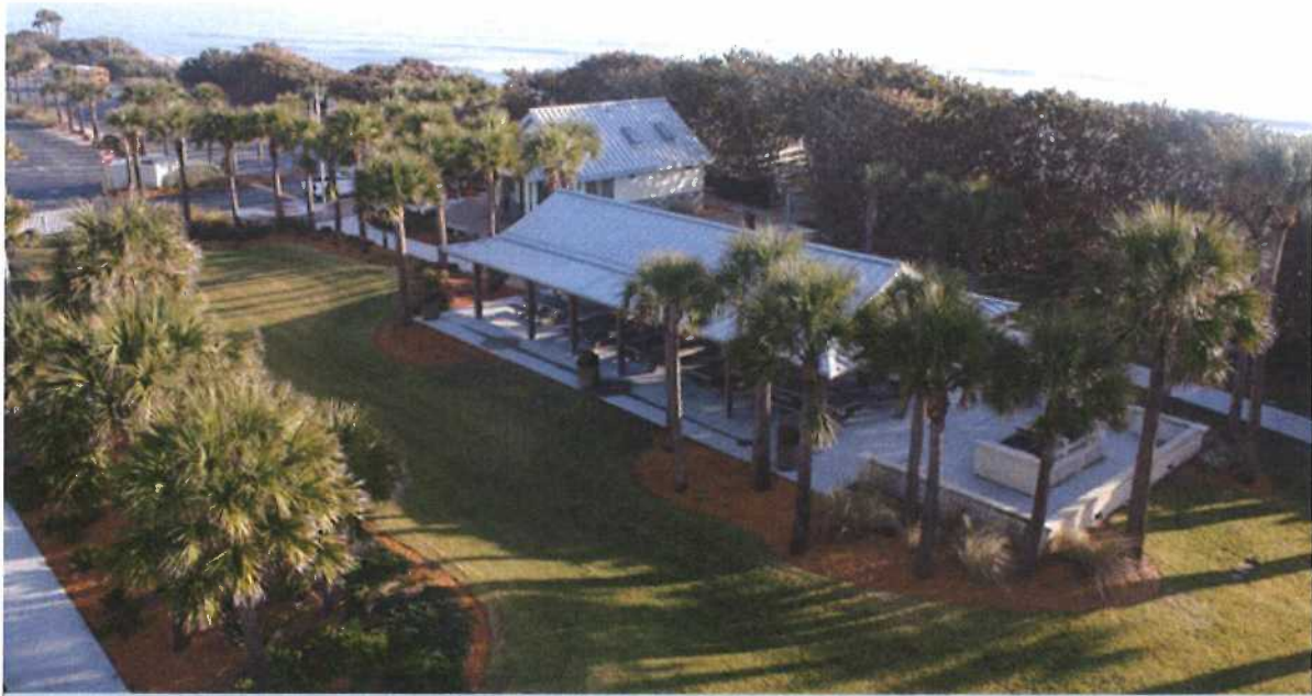
Pelican Beach Park