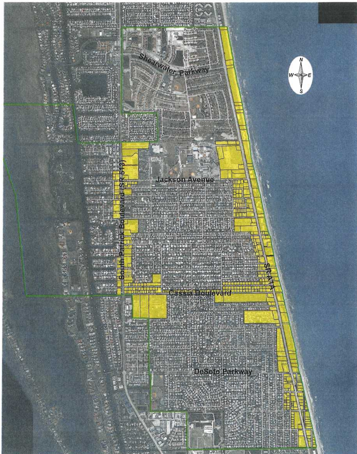
Satellite Beach Community Redevelopment District