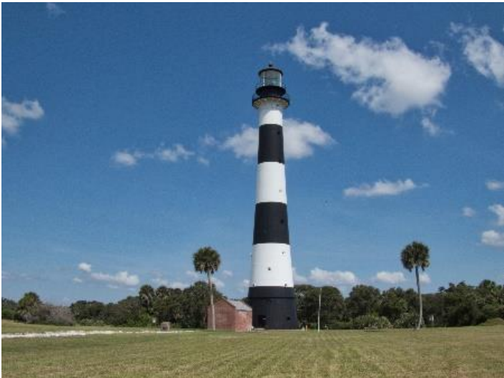
Light Station 1966-2019