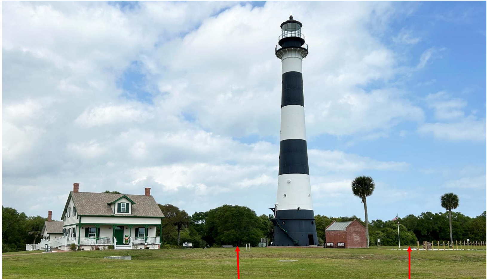
New Lighthouse Experience Cottage Site