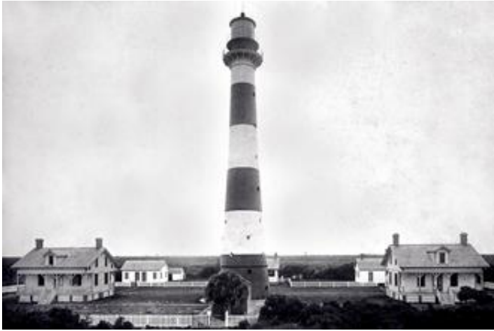
Light Station 1894-1965