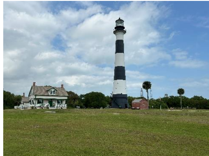
Light Station 2019-present