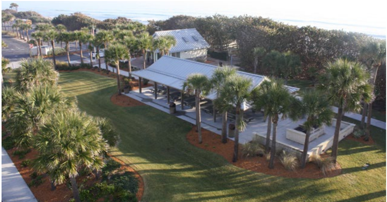
Pelican Beach Park