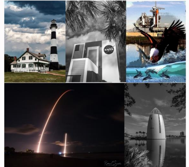
Selections currently featured at Space Coast Office of Tourism