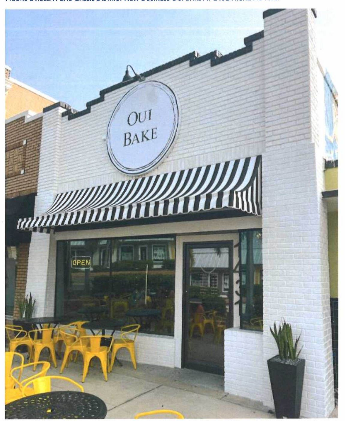
FIGURE 1 RECENT EAU GALLIE DISTRICT NEW BUSINESS OUI BAKE AT 1431 HIGHLAND AVE.