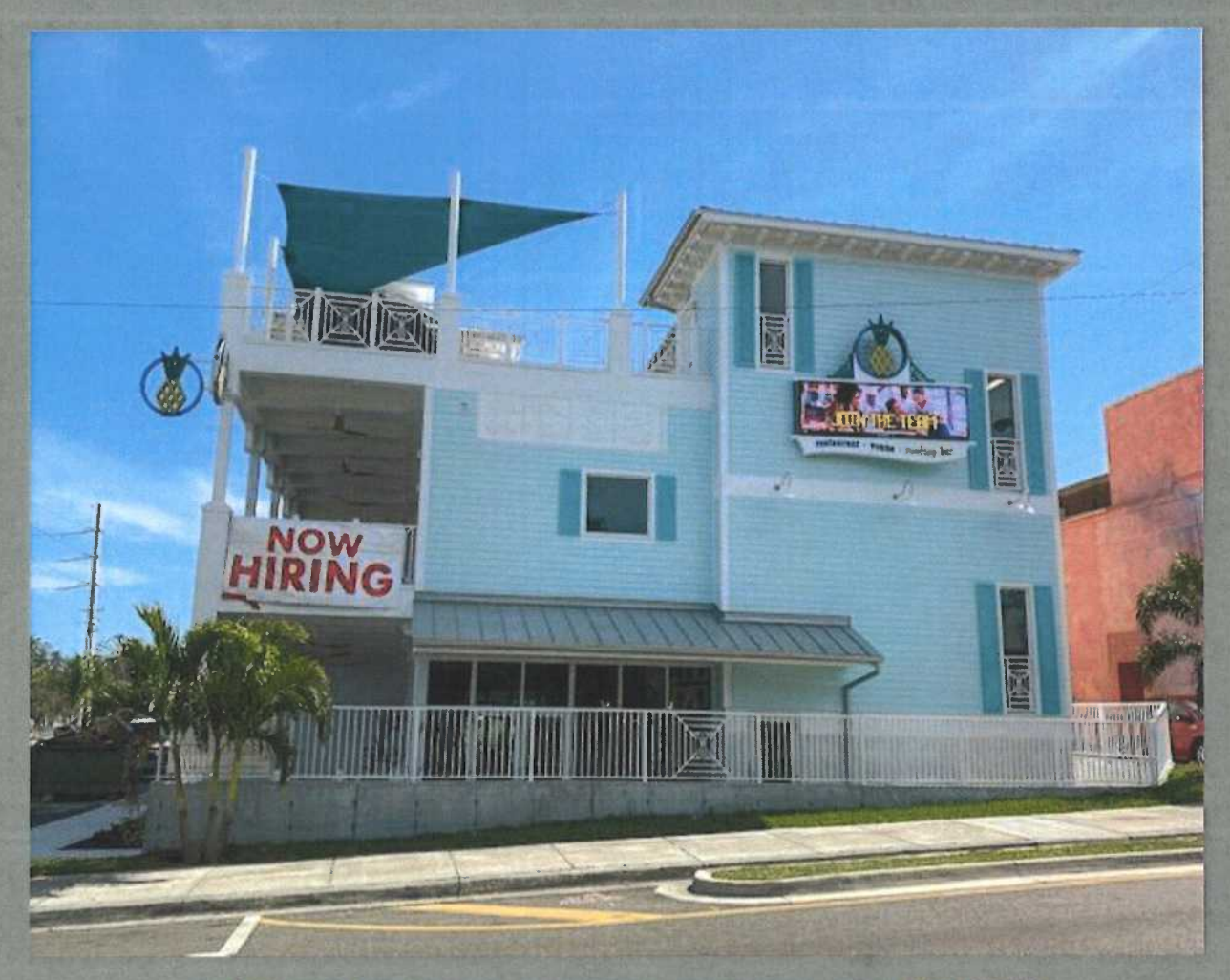
PICTURED ABOVE IS PINEAPPLES, A RESTAURANT NEW TO THE EAU GALLIE ARTS DISTRICT