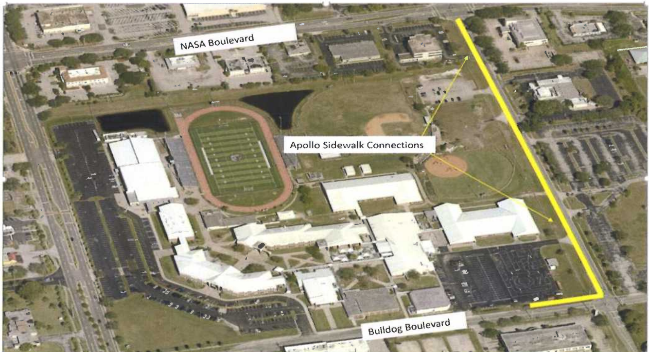
FIGURE 2 – APOLLO SIDEWALK CONNECTIONS