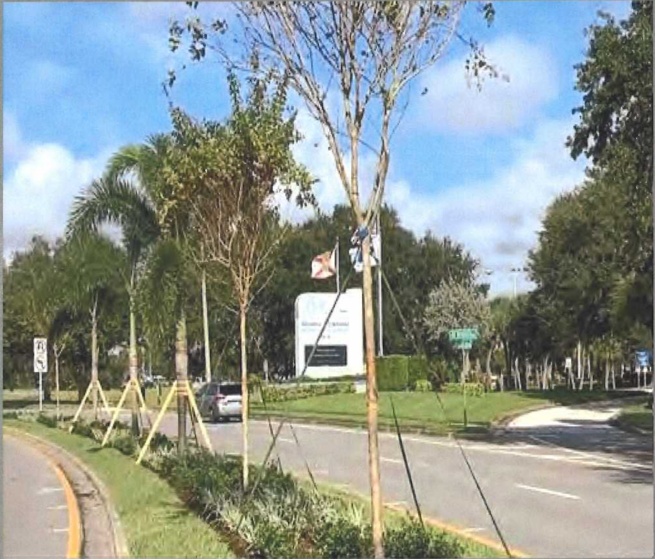
PICTURED ABOVE IS ONE OF THE MEDIANS ENHANCED BY THE NASA BOULEVARD LANDSCAPE MEDIANS PROJECT