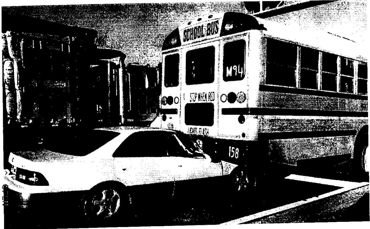
Stacey Barchenger, FLORIDA TODAY