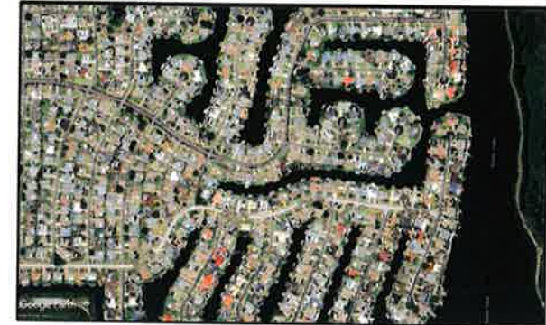
VICINITY MAP 285 DIANA BOULEVARD, MERRITT ISLAND, FL 32953 (NOT TO SCALE)