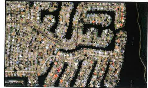
VICINITY MAP 285 DIANA BOULEVARD, MERRITT ISLAND, FL 32953 (NOT TO SCALE)