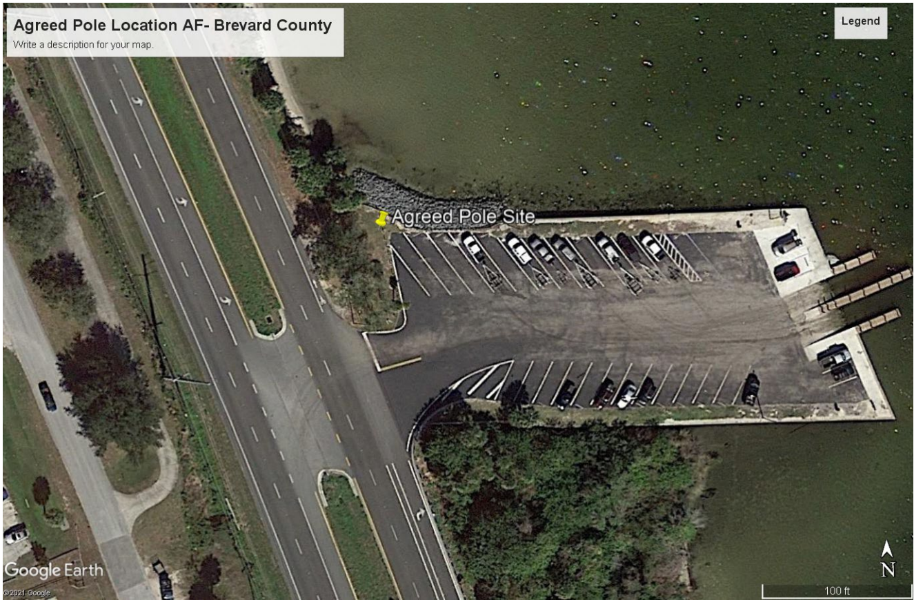
Figure 3 Aerial View of Port St. John Boat Ramp with Agreed Pole Location Identified by Yellow Push Pin