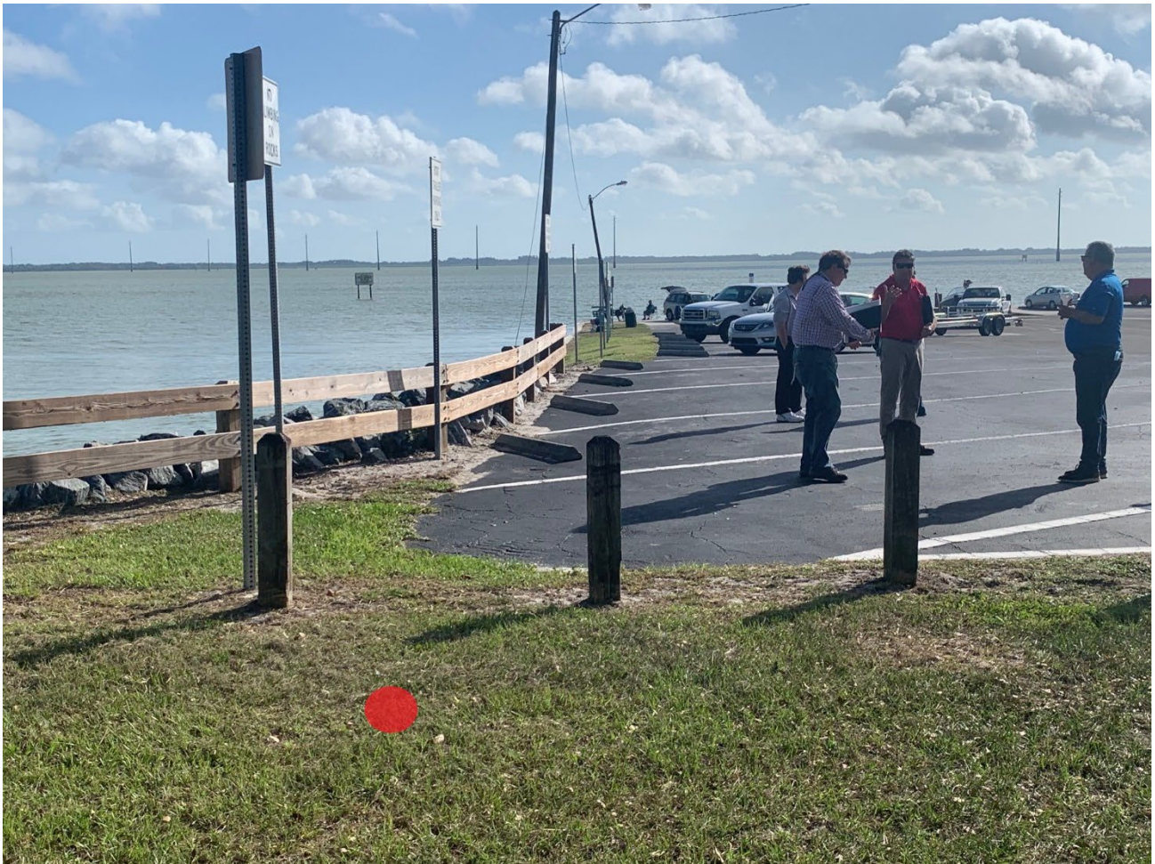
Figure 5 Photo Taken From the North East Corner of Port St. John Boat Ramp with Agreed Pole Location Identified by Red Dot