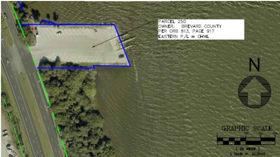
Figure 1 Aerial View of Port St. John Boat Ramp Outlined in Blue