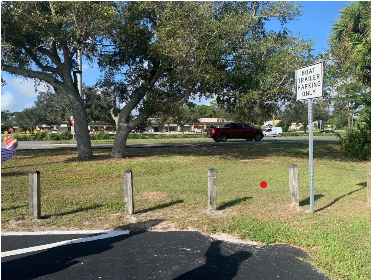
Figure 4 Photo taken from Port St. John Boat Ramp Parking Lot of Agreed Pole Location Identified by a Red Dot