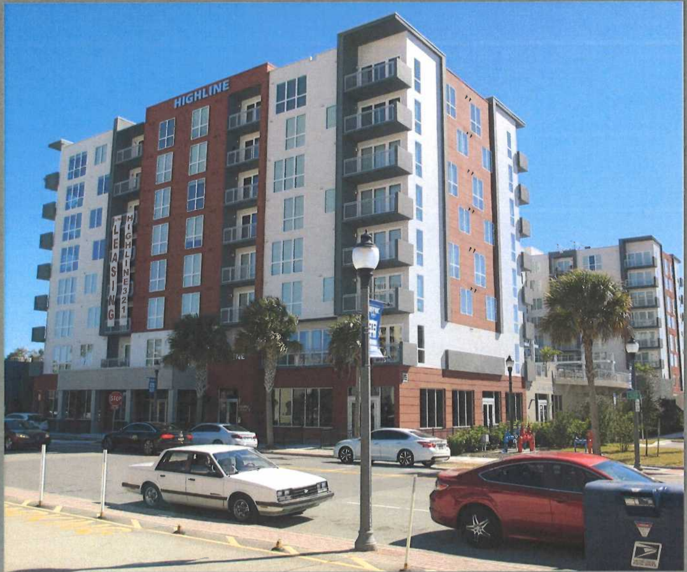
PICTURED ABOVE IS THE COMPLETED HIGHLINE APARTMENT PROJECT