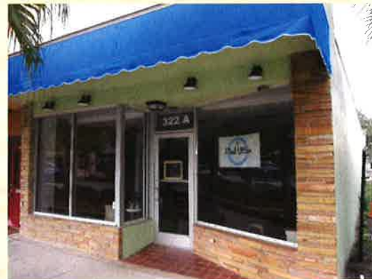
Mad Utter Ice Cream at 322 A S. Washington Ave.