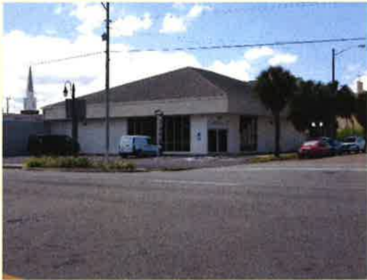
Curaleaf at 200 S. Washington Ave.

A goal of the City's CRA Plan is to encourage private sector investment in the CRA. New building construction and major renovation work to existing buildings helps the City in combating blight. It also encourages others to invest in the CRA. Thirteen (13) new businesses located in the CRA during the fiscal year. Here are some examples of some of the new businesses and major renovation construction that occurred in FY 2018 – 2019 in the CRA District: