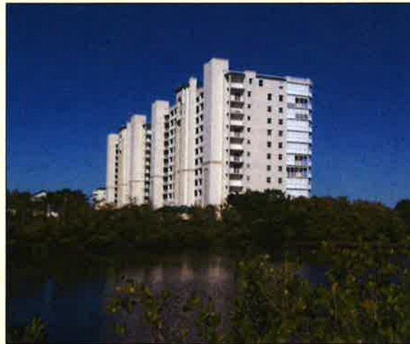
Harbor Pointe Condominiums on Indian River Avenue

In 2011, the CRA authorized issuance of a Public Improvement Revenue Note in an amount not to exceed $2,535,000 to finance roadway and landscaping improvements in conjunction with the FDOT U.S. 1 project. In February 2013, the CRA approved partial repayment of the loan for $850,000. The repayment funds were the result of lower than anticipated projects costs. The CRA's action produced a total savings of $1.27 million. The CRA also paid off the Commons Project Bond at a cost of approximately $95,000. The loan repayments reduced the annual debt service in FY2014-2015 from 34% to 19% of the Annual Revenues, thus providing more opportunities for capital projects in the future. The percentage of annual debt service to annual tax increment values in FY 2016 – 2017 was further reduced to 17% due to a combination of the increase in tax increment values and debt payments. Annual Debt Service in FY2017-2018 was further reduced to 15.7% of the Annual Revenue. Annual Debt Service in FY 2018-2019 again was reduced to 14.66% of the CRA's Annual Revenue.