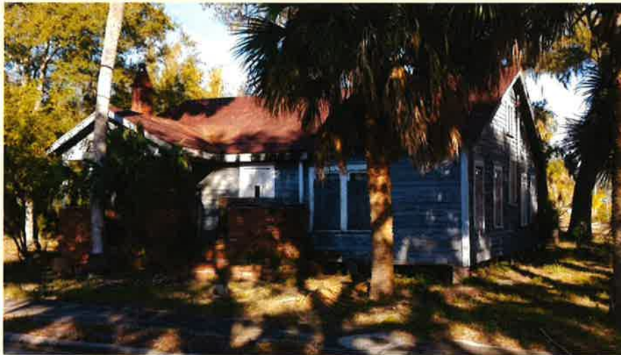
Gibson-Rivers House at 723 S. Palm Ave.

The CRA District is home to many of the City's historic resources. The preservation of these historic resources in the community redevelopment district adds to the City's pride and creates pedestrian and visitor appeal, which provides economic development for the City. During the fiscal year the CRA recommended to the City Council that a Historic Preservation Plan be adopted. A twelfth property, the Gibson-Rivers House located at 723 S. Palm Avenue which also is in the CRA District, was added to the City's Local Historic Register in July 2019. The Historic Preservation Board also created a Historic Landmarks brochure which highlights the City's National and Local Historic Register properties and State Historic Markers, again many of which are located within the CRA district.