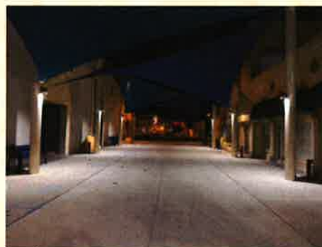
Security lights in the Julia Courtyard