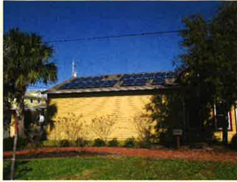
Solar panels on the Welcome Center roof