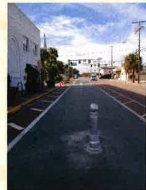
Completed Downtown Connector Trail