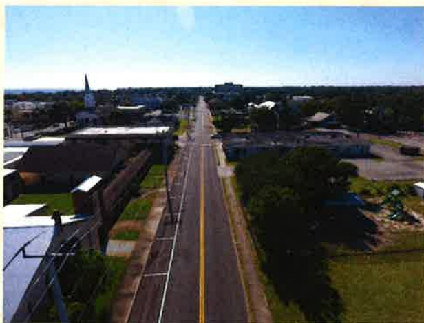
Palm Avenue Resurfacing

Palm Avenue from South Street to Garden Street and Orange Street between S. Washington Avenue and Indian River Avenue were resurfaced in August, 2019. The cost to repave the streets was $150,000. The streets were cracking and in need of repair. The paving also adds to the appearance of the CRA and helps economic development by providing well maintained streets.