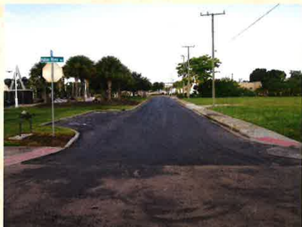
Orange Avenue east of S. Washington Ave. Resurfacing