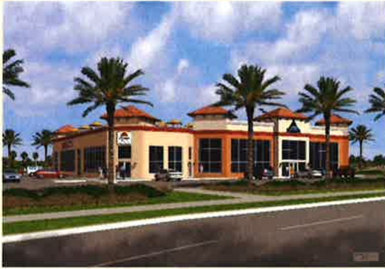
Beachwave New Construction Development