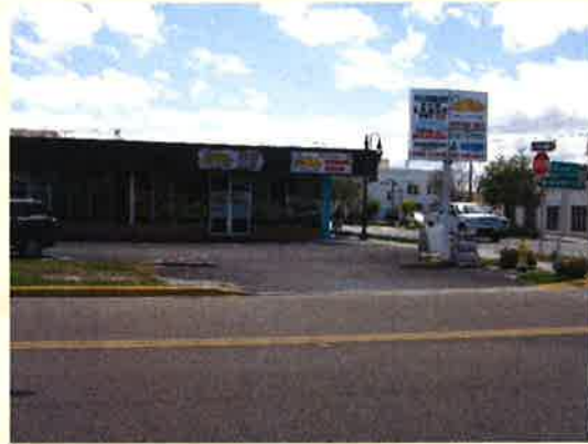
C's Waffles at 125 Broad St.