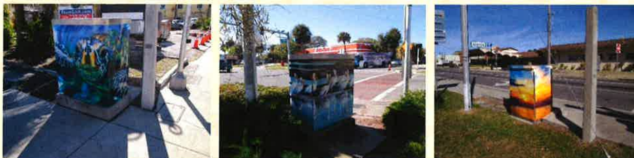
Traffic Signal Box Art Wrap examples

The CRA partnered with the non-profit organizations, the Greater Titusville Renaissance (GTR) and the North Brevard Art League to create eight (8) vinyl art wraps to be placed on traffic signal boxes on U.S. Route 1 in the CRA between Grace Street to the south and Garden Street to the north. GTR and the North Brevard Art League solicited a call for art with Titusville history, nature and space themes. The art work was approved by the CRA at their September 2018 meeting. Since U.S. Route 1 is a Florida Department of Transportation (FDOT) right of way, the signal box art work proposal was submitted to the FDOT as part of an Aesthetic Feature Agreement. The vinyl wraps were installed in Fiscal Year 2019. Later in the fiscal year FDOT enlarged two (2) of the boxes which required the replacement boxes to be wrapped. The art wraps further the Vibrant Community Initiative – support of the arts goal of the Redevelopment Plan.