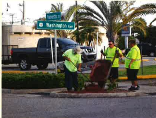
Maintenance workers mulching a S. Washington Ave. landscape bed

In FY2018, the CRA funded the creation of a part-time maintenance worker to perform a variety of duties that include but are not limited to, litter control, vegetation maintenance, garbage removal, painting, graffiti removal, reporting acts of vandalism, etc. The position was needed due to the increase in the number of visitors to the downtown, many coming to experience the regional and national trails converging in Titusville. The position was funded in FY2019 however the part time employee took ill during the year and did not return to work. The maintenance duties had to be picked up by other Public Works staff while the position was advertised and a person chosen to fill the position which did not occur during the fiscal year.