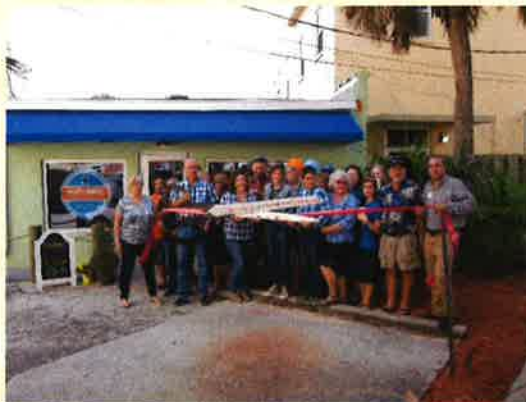
Pier 13 Coffee at 322 B S. Washington Ave.