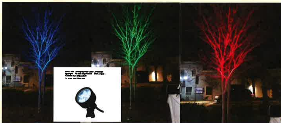
Julia Street Parking Lot Landscape Lighting

Accent landscape lighting was added to the perimeter of the Julia Street parking lot with eight (8) LED color changing spotlights that are directed upwards into trees along the landscape beds bordering S. Washington Avenue, S. Hopkins Avenue, and the entrance drive on Julia Street. The total cost of the light installation was $1,184. The lighting color is changed based on holidays and events. The lighting adds to the vibrancy of the CRA.