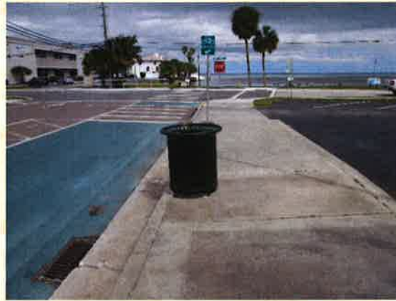
New trash receptacles at the Julia Parking lot and at Main St. near Indian River Avenue