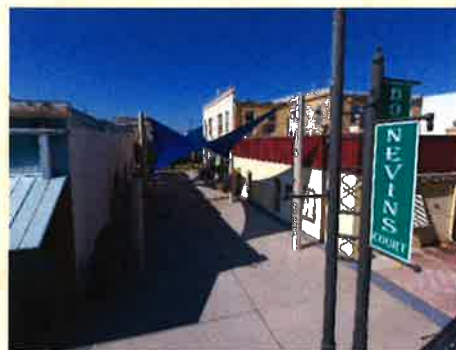
Completed Julia Courtyard and Nevins Courtyard Renovations