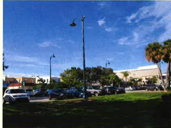
New Commons Parking Lot lighting