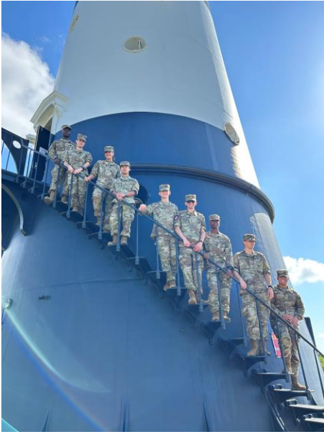
Space Force personnel around the world come to visit “their” lighthouse!