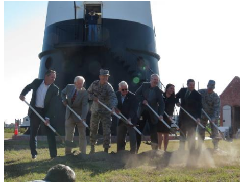
2018 Groundbreaking for the Museum and Gift Shop