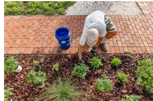
Keep Brevard Beautiful and Master Gardeners transformed the grounds as part of the first national Adopt-A-Landmark program