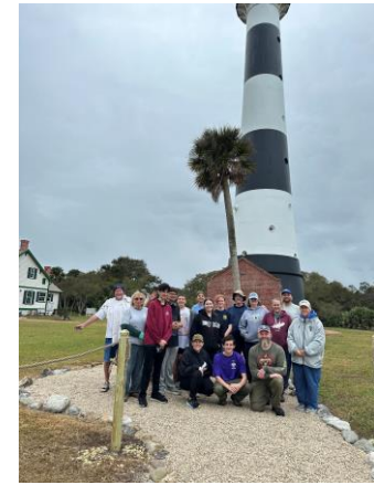
2024 Eagle Scout Project to build a new fence and refresh the shell walkway. 2 more Eagle projects in work for 2024-25.