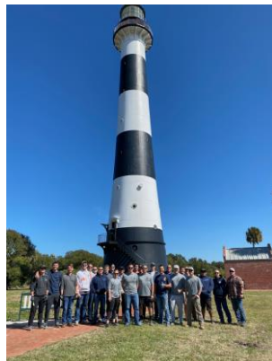
US Coast Guard members volunteer several times a year to help maintain and improve the light station