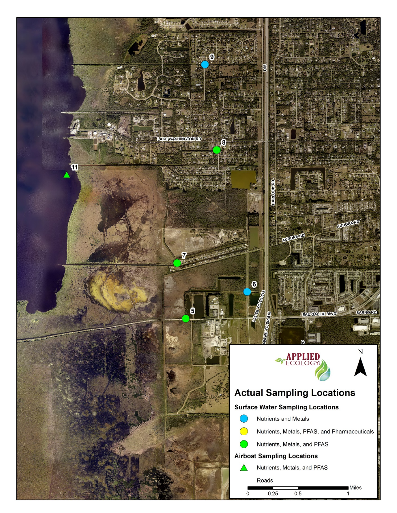
Figure 2. Sample locations and parameters analyzed at five water quality sites draining residential areas near Lake Washington and one site within Lake Washington.